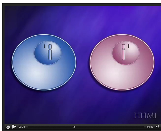
Figure 3. A short animation on the HHMI Biointeractive site illustrates how X inactivation works in female mammalian cells.

The companion Teach.Genetics website at http://teach.genetics.utah.edu/content/epigenetics offers resources for instructors. The DNA and Histone Model activity reinforces students' online learning through a hands-on experience. Students cut out templates to create a model that allows