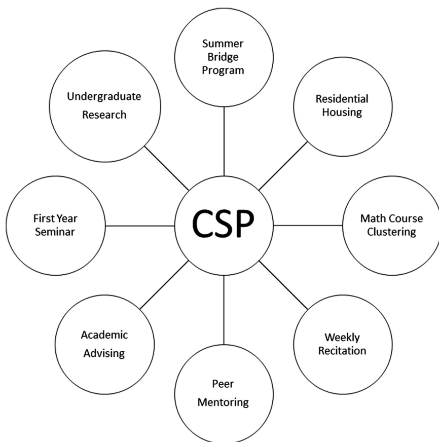
FIGURE 2. CSP program components.

Biweekly Advising. Students meet with a CSP administrator twice a month for at least 30 min. During these advising sessions, students complete a survey to document their academic performance and identify any nonacademic concerns they are experiencing. They must also report their attendance, grades on exams, assignments, actual grades, desired grades, and actions that should be taken to improve their grades.