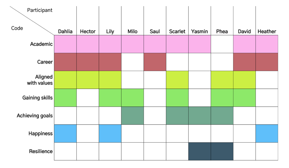
FIGURE 1. Heat map of participants' definitions of success. Participants are listed horizontally across the top of the chart, and components of participants' definitions of success are listed vertically on the left side of the chart. Filled-in sections represent the presence of the component (code) in participants' definition of success.

In addition to academic and career success, students often mentioned that they would feel successful if they were able to move through their graduate program in a way that was aligned with their values. The "aligned with values" code was assigned to any definition of success in which participants mentioned seeking fulfillment, delineated their value systems, or related their success to a value they had mentioned previously in the interview (e.g., helping others, honesty). For example, David's definition of success included "[finding] emotional and intellectual fulfilment, within a career that also allows me to make money with a product framework that does