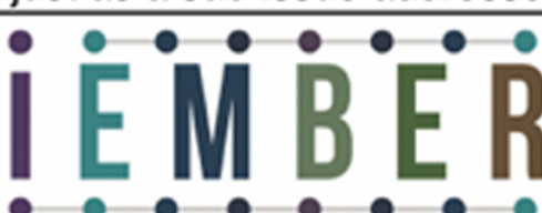
Figure S3: What Can You Do To Help Diversify Your Scientific Society?